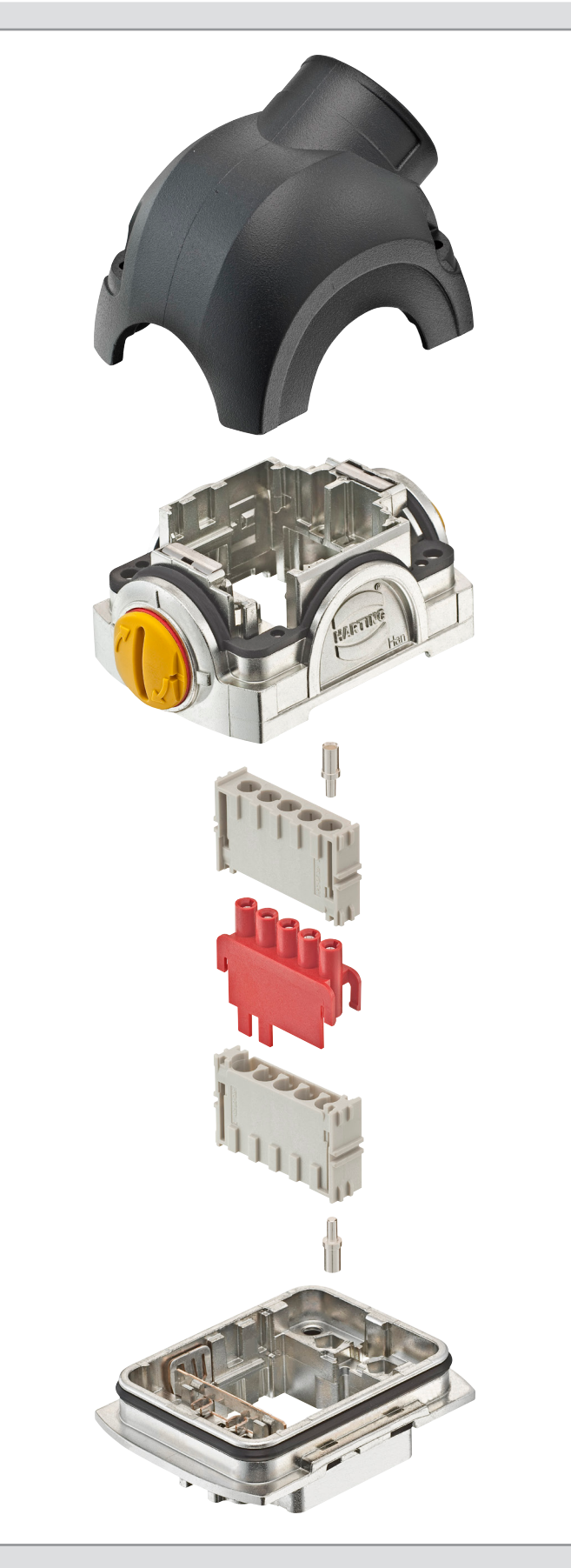
User-defined modularity means creating a custom connector with standard components.

HARTING has based its leadership on developing new connector concepts and adapting existing ones to more precisely meet the evolving needs of its customer base. Choosing the right connector solution for the job will optimize the benefits of connectorization, improving the OEM's margins while giving end users the lowest possible cost of ownership and greater peace of mind.