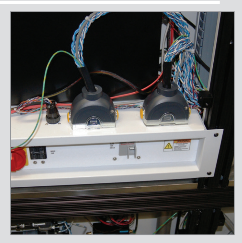
Connecting cables to devices using connectors is a matter of plug and play

With modular design and connector-based wiring, the machine can be shipped to the customer in smaller pieces, reducing transportation costs and the risk of damage. Faster field assembly with much less risk of wiring errors translates into major cost savings for the OEM. Troubleshooting and maintenance are similarly accelerated. During the warranty period,