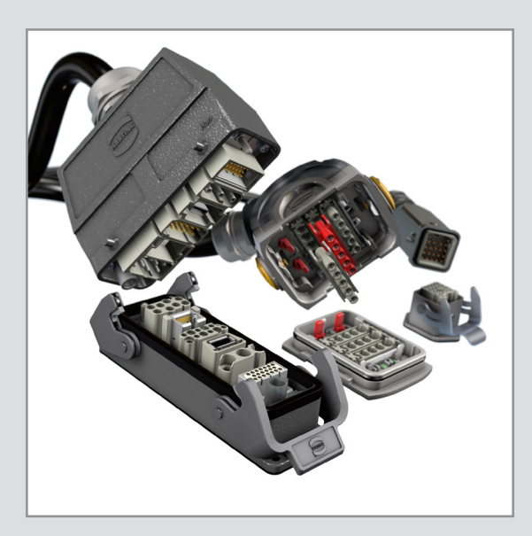
Today's modular connectors offer many benefits over hard-wired connections.

Using connectors makes the wiring for the same machine a preengineered job that can be designed, assembled and tested as a harness and then quickly integrated into a machine or system as it takes shape. Some time is invested in assembling the harness, but then installation only takes a fraction of the time hardwiring requires. The risk of wiring errors is virtually eliminated. That's why hardwiring has a dwindling appeal, increasingly limited to production where substantially all connections are made just once, at the factory, with little or no field assembly required.