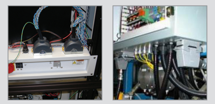
Field assembly time for devices and control cabinets is dramatically shortened using connectors instead of hard-wiring.

Similar stories are told by makers of boats, robot manufacturers wind turbines, stage equipment, casting machinery, packaging and forming equipment and many more. Any company using hardwiring in manufacturing or upgrading equipment is a candidate to save money and time, improve efficiency and customer satisfaction by adding connectors at appropriate locations on wiring and cable runs.