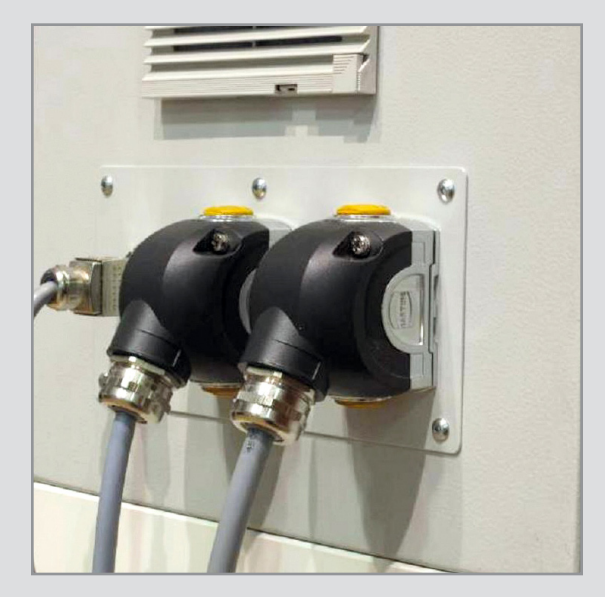
Modular connectors can be configured to carry power, signal and/or data in the same easy-to-install unit.