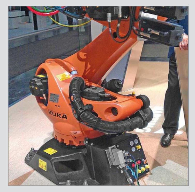
Connectors simplify design, assembly and maintenance for robots and other modular machinery.